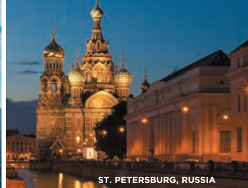
ST. PETERSBURG, RUSSIA