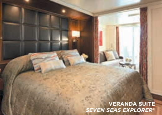
VERANDA SUITE SEVEN SEAS EXPLORER®