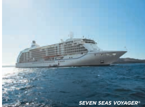
SEVEN SEAS VOYAGER®