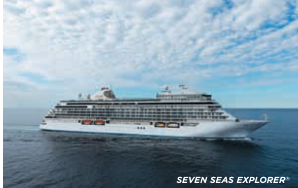
SEVEN SEAS EXPLORER®