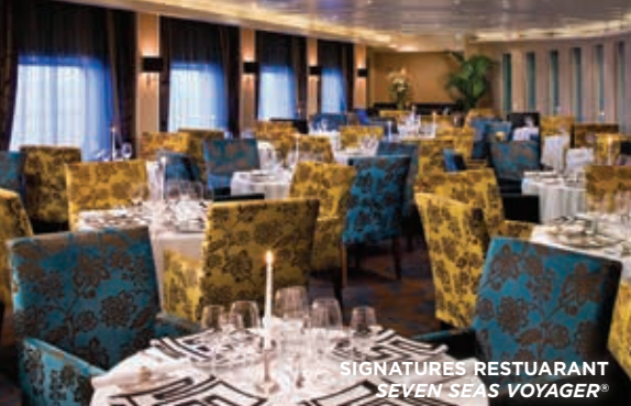
SIGNATURES RESTUARANT SEVEN SEAS VOYAGER®